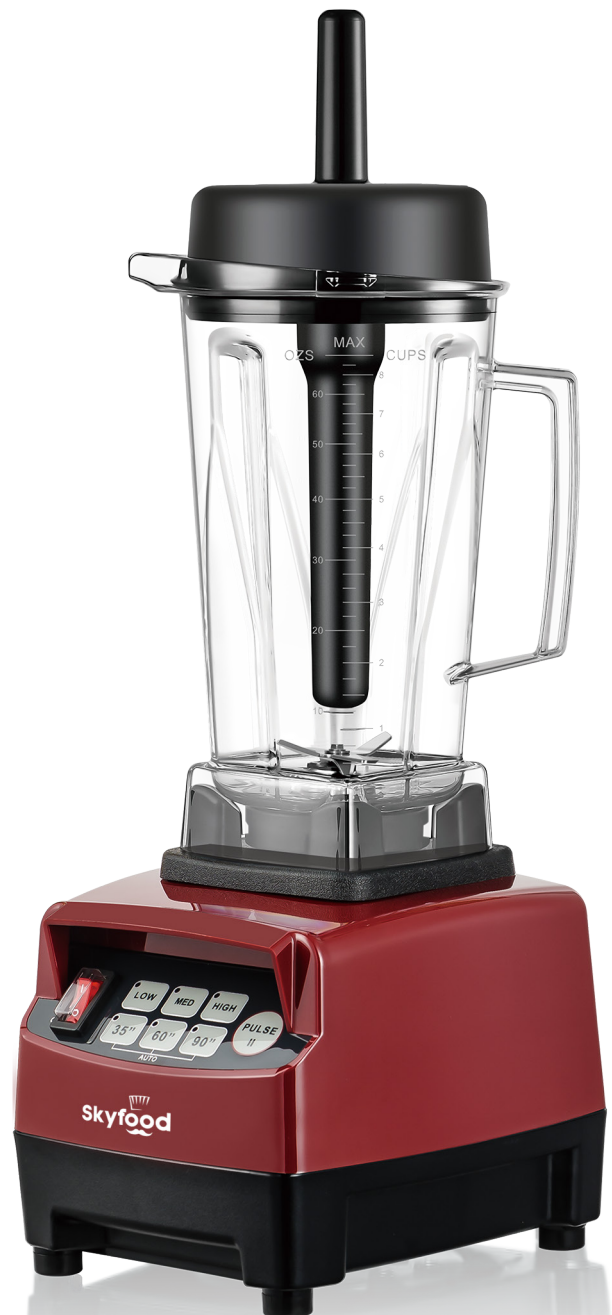
BS2 Supreme Blender

ILLUSTRATIVE PHOTO, ACTUAL PRODUCTS AND ACCESSORIES ARE SUBJECT TO CHANGE WITHOUT NOTICE.