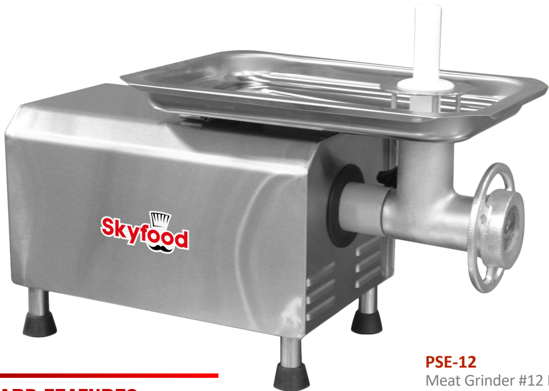
PSE-12 Meat Grinder #12 Hub