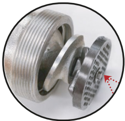
ASSEMBLE ORDER: WORM, KNIFE AND PLATE