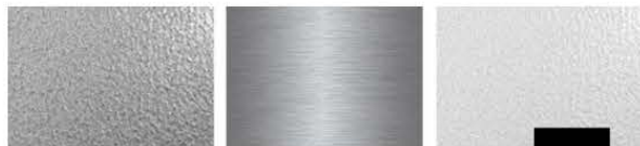
Stainless Steel, White Smooth or Stucco Finishes. Also available in Black.